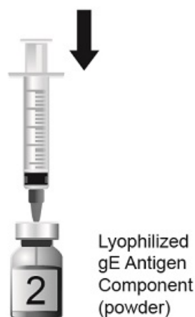
Figure 2. Slowly transfer entire contents of syringe into the lyophilized gE antigen component vial (powder). Vial 2 of 2.