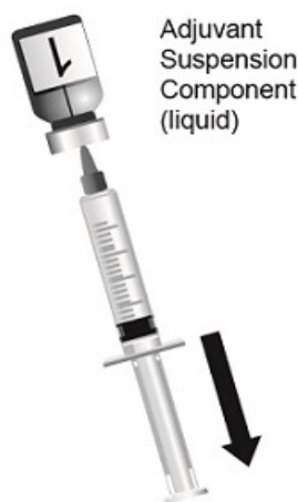
Figure 1. Cleanse both vial stoppers. Using a sterile needle and sterile syringe, withdraw the entire contents of the vial containing the adjuvant suspension component (liquid) by slightly tilting the vial. Vial 1 of 2.

component (powder) with the accompanying AS01 B adjuvant suspension component (liquid). Use only the supplied adjuvant suspension component (liquid) for reconstitution. The reconstituted vaccine should be an opalescent, colorless to pale brownish liquid. Parenteral drug products should be inspected visually for particulate matter and discoloration prior to administration, whenever solution and container permit. If either of these conditions exists, the vaccine should not be administered.